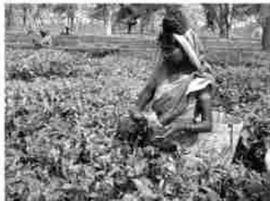
A woman plucking tea leaves

Significantly the colonial administrators were clear that harsh measures were taken against the labourers to make sure they benefited the planters. They were also fully aware that the laws of a colonised country did not have to stick to the democratic norms that the British back home had to follow in Britain.