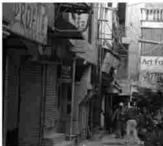
A view of an urban village

Writing on the different kinds of urbanisation witnesses in the first two decades after independence sociologist M.S.A. Rao argued that in India many villages all over India are becoming increasingly subject to the impact of urban influences. But the nature of urban impact varies according to the kind of relations a village has with a city or town. He describes three different situations of urban impact as mentioned in the box.